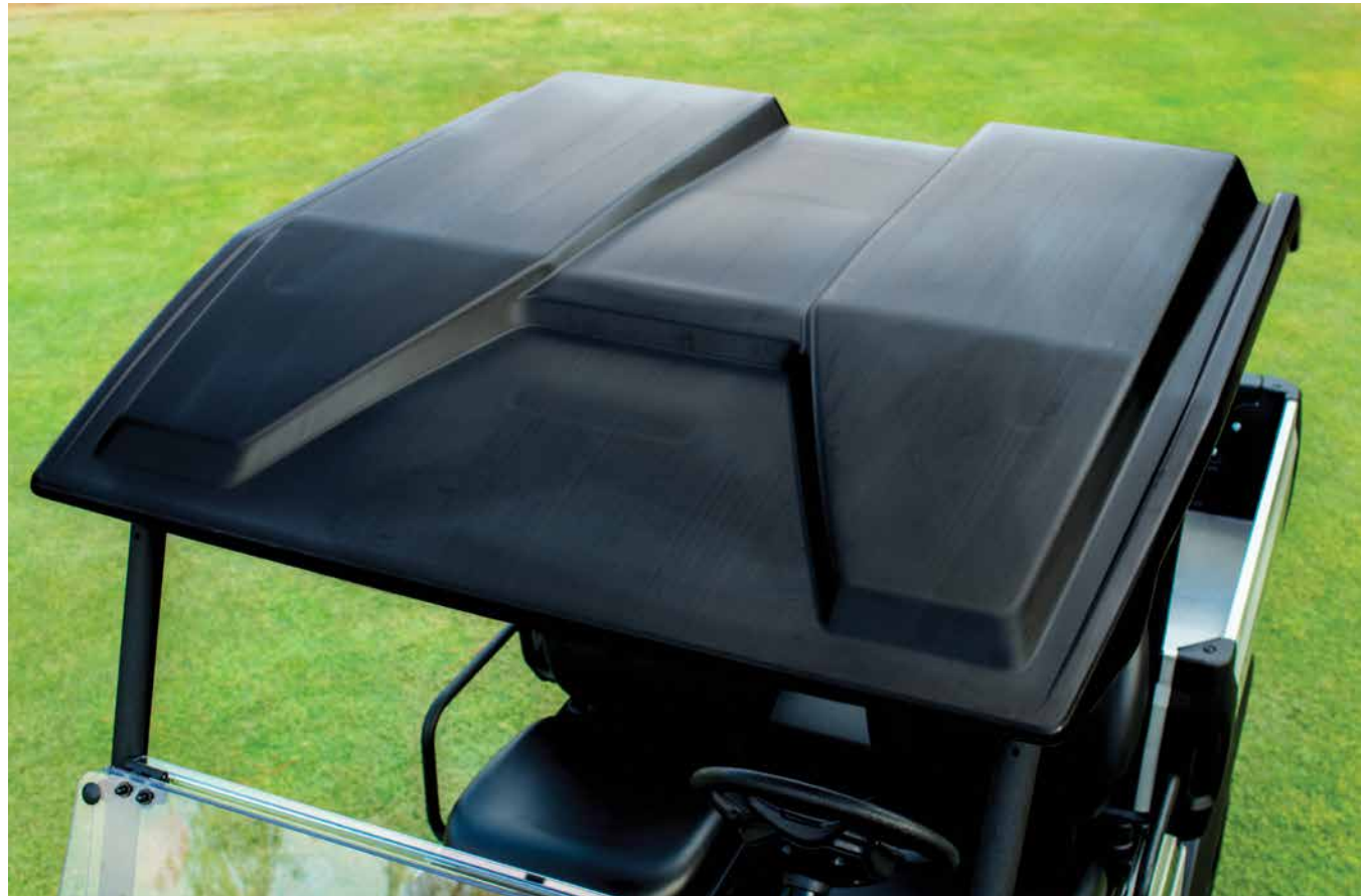
UMAX Sun Top Kit

Guard yourself against the Sun's glare, hanging brush, and other elements with the only sun top designed to completely match your UMAX vehicle in style and durability. Fits 2019-2023 UMAX One/Two Rally models.