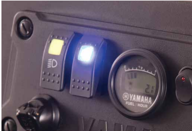
UMAX Headlight High/Low Switch

Add the option to switch between high- or low-beam front LED headlight with our Headlight High/Low Switch. With easy plug-and-play installation in the front dash panel, it will seamlessly match the factory headlight on/off switch. Fits 2019-2023 UMAX Rally models.