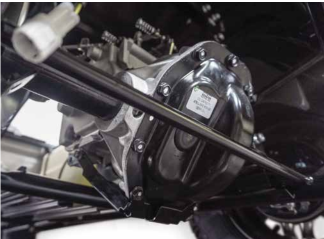
UMAX Rear Arm Skid Plate

NOTE: Will not work with Range Picker Mount.