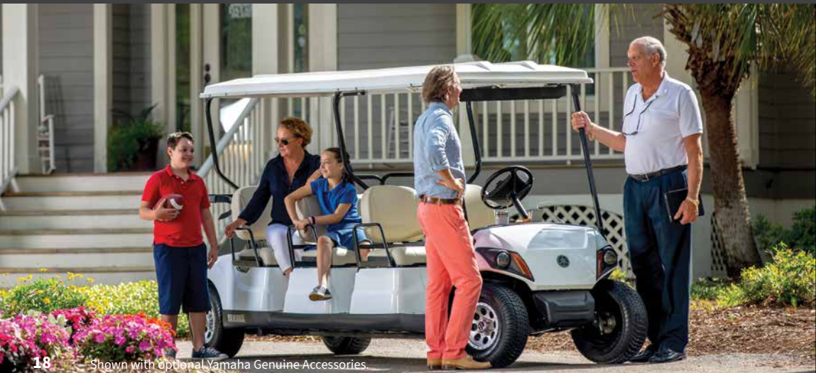
Shown with optional Yamaha Genuine Accessories.

We've outfitted both our four and six-seat Concierge models with a wealth of features to inspire the most enjoyable experiences for your riders.