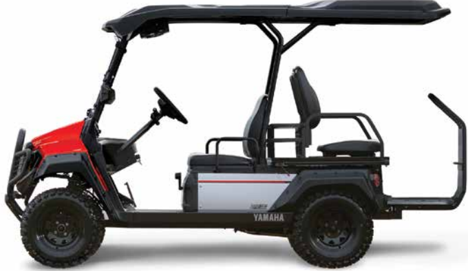
CORAL RED Metallic