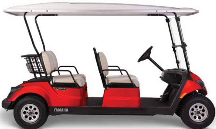
CORAL RED Metallic