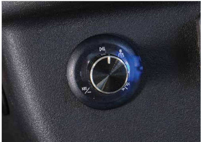
Bluetooth® Audio Controller

Make your sound system just as easy to control in your Yamaha as it is in your family car with our Bluetooth® Audio Controller that allows you to change songs, adjust volume and pause/play. Pairs perfectly with the MA100 Speaker/Amp Package (GCA-MA100-00-00)—sold separately. Universal fit for most golf cars.