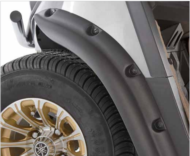
Drive² Fender Flare Kit

Guard yourself and your UMAX vehicle even more with our wide, off-road, four-piece fender flare kit, designed and engineered to perfectly match your Yamaha in every way. Fits all 2019-2023 UMAX Rally models. DEFENDER (WIDE) J0G-F15E0-T0-00 DEFENDER JR. (NARROW) (INSET) J0G-F15E0-V0-00 NOTE: Use of 23" tall tires requires 20mm lift.