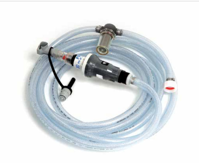
Pro-Fill® Regulated Water Supply Hose

Increase your Yamaha vehicle's battery life and run time by using our Deionizer system—a cost-effective, effortless way to purify the water used for battery watering. Prevent the build-up of impurities over time with this simple addition to your routine service, and it'll make a substantial impact on your battery life. For use with Pro-Fill® by Flow-Rite® Regulated Hose Supply (sold separately). 1 DEIONIZER JN6-DEION-IZ-ER 2 REPLACEMENT PARTS - 600 REPLACEMENT CARTRIDGE JN6-DEION-RP-LC