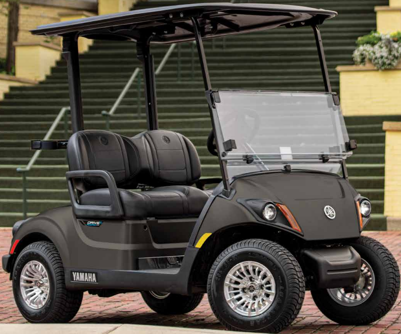
Shown with optional Yamaha Genuine Accessories.

At Yamaha, we're innovating with today's driver in mind. With bold colors and modern body styling, our Drive 2 line-up looks better than ever, but the biggest change is the one you don't see — a smoother ride.