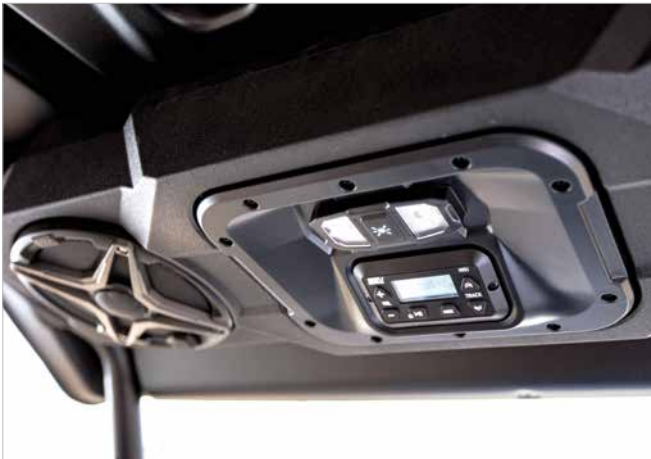
Overhead AM/FM Bluetooth® Audio System

Instead of playing music through your cellphone speakers, enjoy your favorite tunes through our Overhead AM/FM Stereo with Bluetooth® that can withstand the harshest conditions, takes up none of your car space, and gives you impeccable sound quality. This system is fully weatherproof and features 3.5mm AUX-in and USB charging, new SSV Works® waterproof, marine-grade 6.5" speakers, six preset equalizer options, Bluetooth®, AM/FM tuner with LCD backlit display and internally integrated antenna, integrated hyper-white, six LED dome light. Includes wiring, mounting hardware, and step-by-step instructions (simple 2-wire installation). Fits The Drive and Drive² commercial cars and all 2019-2023 UMAX utility vehicles with factory Sun Top.