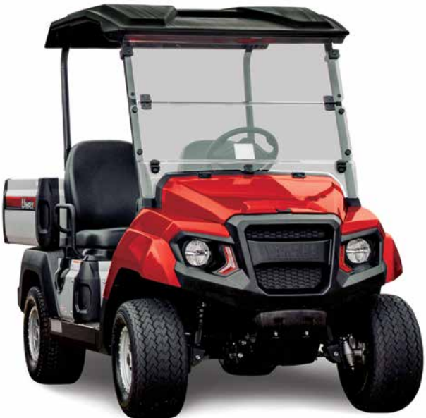
CORAL RED Metallic