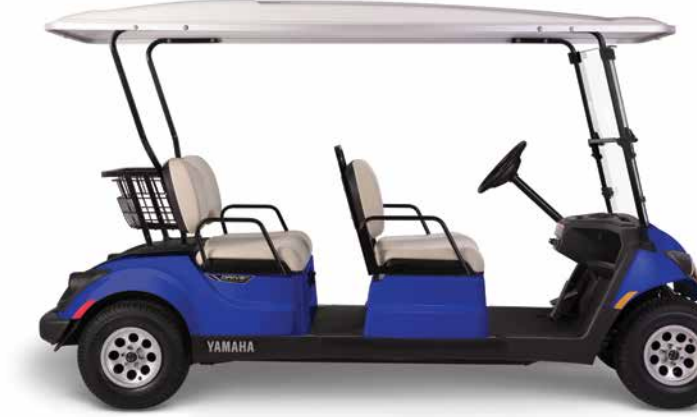
ARCTIC DRIFT Matte