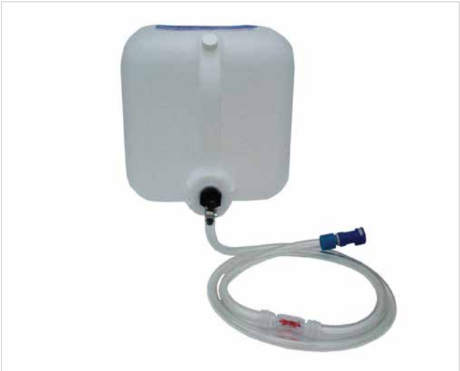
BFS™ Gravity Tank

If you plan to use your factory Trojan® HydroLink® watering system to fill multiple commercial cars in a quick succession, our Pro-Fill® Regulated Water Supply Hose is the perfect solution. For use with Pro-Fill® by Flow-Rite® or Trojan® HydroLink® watering systems. Will not work with Battery Watering Technologies. GCA-JW281-00-00