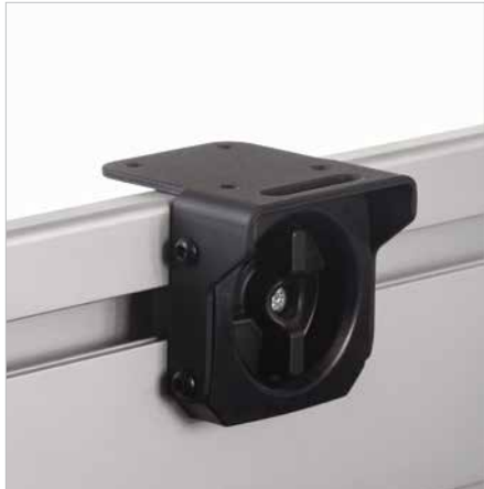
UMAX FusionFit™ Bed Attachment Kit

Our FusionFit™ Bed Attachment Kit will help keep your rakes, shovels, guns, bows and other long-handled tools always at-the-ready. Yamaha's FusionFit accessory system provides a tool-less design that allows you to "click and go" with only a quarter turn. An integrated padlock slot gives you the option to easily secure your cargo and go. Fits 2019-2020 UMAX One/Two, UMAX One/Two Rally, UMAX Range Picker, and UMAX One/Two with Hard Cab models. Sold in pairs.