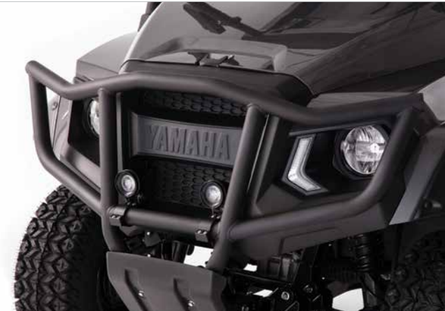
UMAX Front Brush Guards

NOTE: Fits UMAX Two models as is. Cutting of mat required to fit UMAX One EFI models.