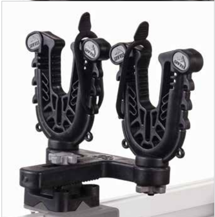
ATV TEK FLEXGRIP™ PRO

NOTE: Requires a UMAX FusionFit Bed Attachment Kit.