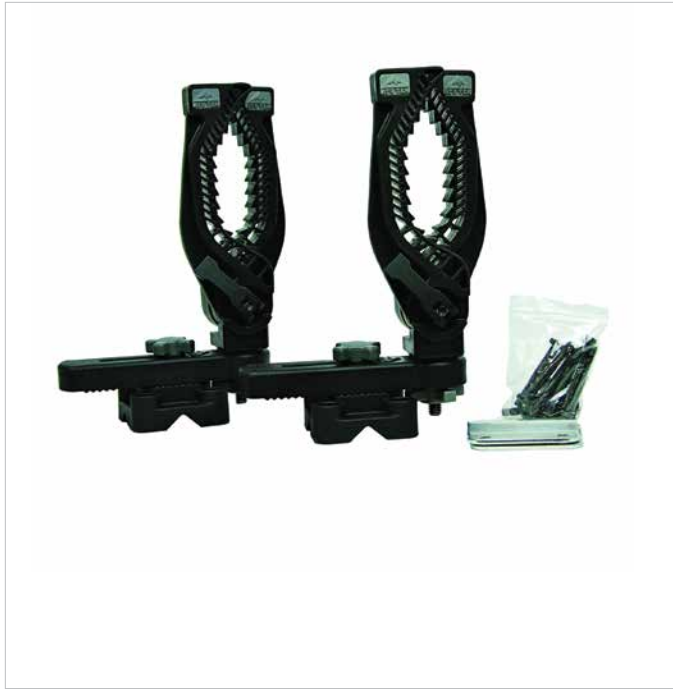
ATV TEK Elite Cam Lock Grip

The ATV TEK V-GRIP offers the most versatility in one multi-use V-Grip. A truly custom fit for your handled tools, soft gun case, bow, ice auger or any other item. Highly adjustable to ensure a perfect, secure fit. Largest size range accommodates more items with infinite locking positions. Quickly and easily access your gear with the tool-free, ratcheting design. Flip cam lock ensures your gear won't fall out while you're hard at work.