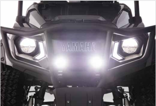
Bullet Accessory Lights

NOTE: Will not work with Premium or Ultra-Premium Light Upgrade Kits.