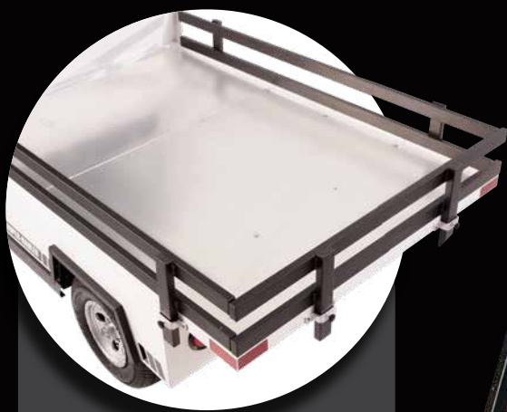
FEATURING 72" X 48" SUPERSIZED ALUMINUM CARGO BED.

Whether you're replacing water heaters or setting up for the day's big event, this extra-large hauler will handle your load. With durable, low-maintenance engineering and a super-sized aluminum cargo bed, it'll save you more than a few trips, not to mention headaches.