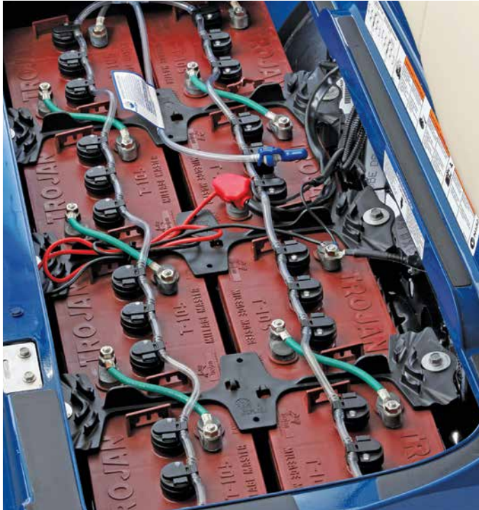
BFS™ Battery Watering System

Sporty styling adds an aggressive, tough look and feel while adding an extra level of protection from mud and water. Fender flares are made from a durable, injection-molded polypropylene, UV-resistant material. Fits all Drive² models including 2017-2023 Drive² Concierge 4/6 models. GCA-J2G56-00-00