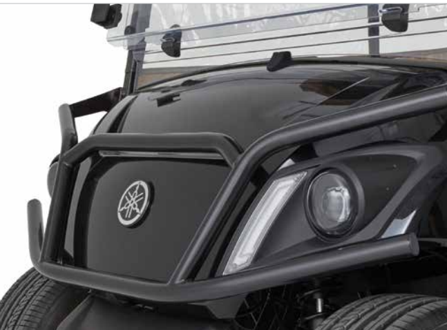
Drive 2 Front Brush Guard

Protect the front end and headlights while adding a little rugged flair with this front brush guard that's designed to seamlessly integrate with the front profile all while creating a tough, aggressive look. Fits 2017-2023 Drive 2 Concierge 4/6 and Drive 2 Super Hauler models.