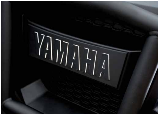
UMAX Yamaha Backlit Logo

NOTE: Accessory Mount Clamps (2HC-F34A0-V0-00) required for installation on Support Sunroof Top or Front Brush Guards, all sold separately.