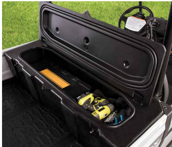
UMAX Cargo Bed Box

You've got a long workday planned. Leave none of your essentials behind with our heavy-duty, durable cargo box that doubles as a non-insulated cooler featuring an integrated drain plug. You'll enjoy easy installation and optimum capacity while matching your UMAX vehicle's uniquely rugged style. Fits 2019-2023 UMAX One Rally EFI and UMAX Two Rally EFI/AC models.