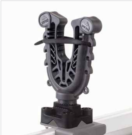
ATV TEK V-GRIP™

NOTE: Requires use of the separately sold ATV TEK V-GRIP™ or ATV TEK FLEXGRIP™ or ATV TEK Elite Series Cam Lock Grip. (Both are available in singles and doubles). Visit ShopYamaha.com to see all options and pricing.