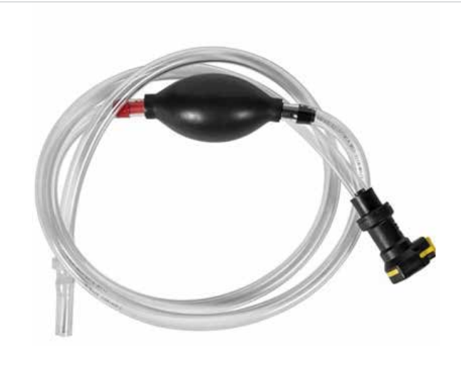
Pro-Fill® Hand Pump

Use the BFS™ Gravity Tank to add water to your Battery Watering System (GCA-JW286-30-00 or GCA-JW286-40-00)—sold separately—using the power of gravity versus manually pumping the water into the system. For use on BFS™ by Battery Watering Technologies systems. GCA-JW286-00-23 NOTE: No Deionizer needed with this.