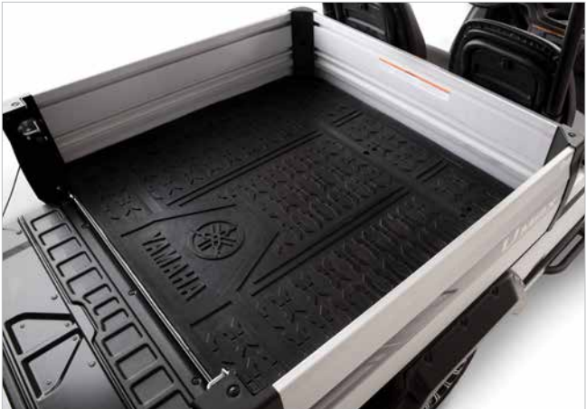
UMAX Cargo Bed Mat

Keep your cargo bed in "fresh out of the box" condition with our wear-resistant, durable Cargo Bed Mat. Made from a proprietary 10mm-thick, reinforced, engineered rubber that slows bed wear as it reduces noise and resonance when transporting cargo. Also, the mat's rough-and-tough styling perfectly matches your UMAX vehicle's look while the aggressive lug pattern helps prevent cargo from sliding. Fits 2019-2023 UMAX Rally One EFI and UMAX Rally Two EFI/AC models.